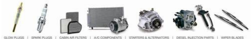
GLOW PLUGS | SPARK PLUGS | CABIN AIR FILTERS | A/C COMPONENTS | STARTERS & ALTERNATORS | DIESEL INJECTION PARTS | WIPER BLADES