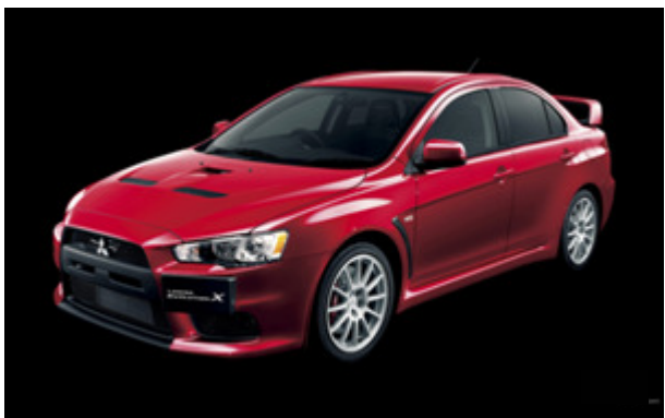
Mitsubishi Lancer EVO X