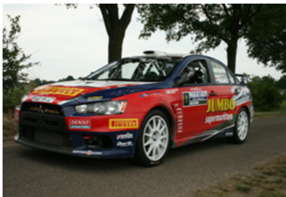
IRC Rallye - Mitsubishi van de Heuvel team DENSO sponsorship